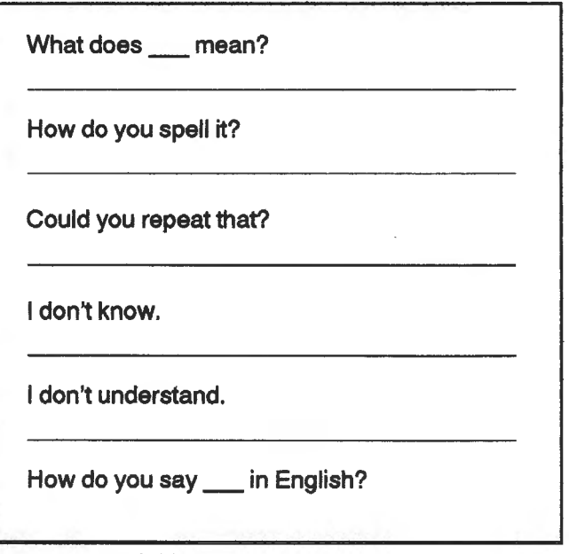
Figure 1. Useful language for the classroom

Our students can stay in English. To do so, we need to give them a reason and a way... and trust them with the responsibility of doing it themselves.