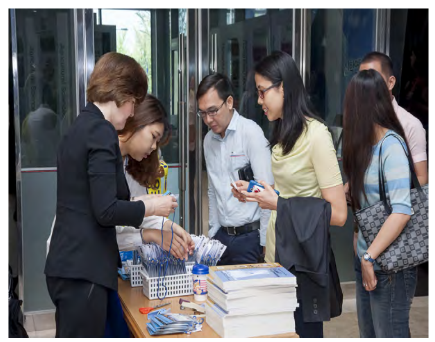
Checking in at the conference. This year's national conference took place in Daegu, at Kyungpook National University.