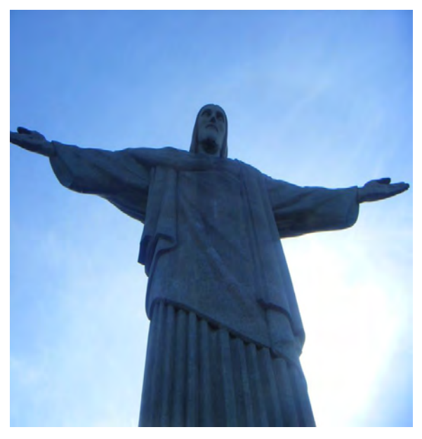
Christ the Redeemer statue in Brazil

The cost of living is quite high, which takes many people by surprise. Fruit and vegetables are very cheap, but anything processed or imported is very expensive. Many fruit and vegetable stores have a 'per kilo' section with a set price, usually around R$1.80 (820W) per kilo. If you love tropical fruit, you will love these stores! Expect to find mangoes, bananas, guava, and passion fruit along with cacao fruit, cupuacu, jabuticaba, and caju (the fruit from cashew trees) which can only be found in Brazil. You should bring all electronics you think you might need, as the prices here will scare you! Transport costs are generally high, and transportation is limited. Most cities have bus services, but they can be sporadic and overflowing with people. Transit times can be excessive in big cities (two or more hours each way) on overcrowded buses.